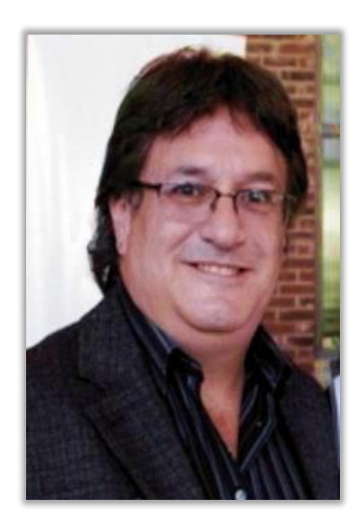
In May 2019, the Foundation welcomed a new Administrative Coordinator,