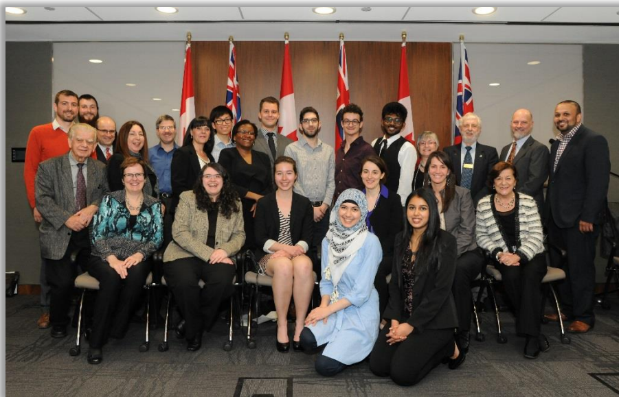
. Directors, members, award winners and guests at the 2016 AGM