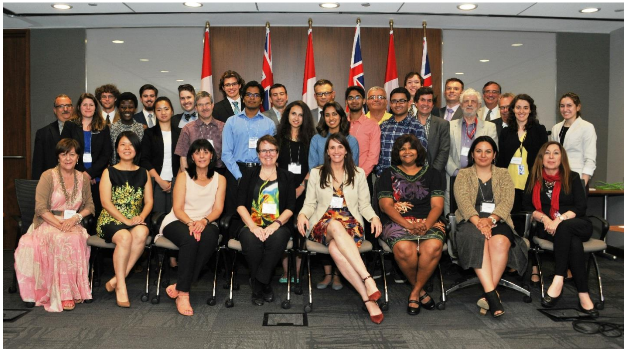
Directors, members, award winners and guests at the 2017 AGM