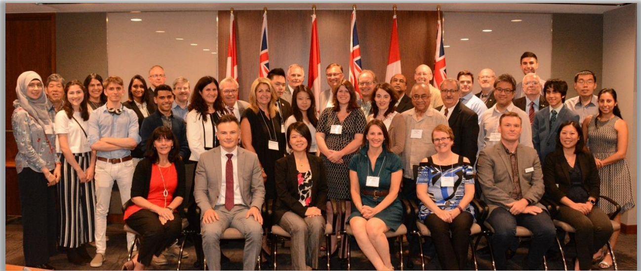
Directors, members, award winners and guests at the 2018 AGM

Note: The Directors are retired at each annual meeting of the members of the Engineers Foundation, but are eligible to be re-elected if otherwise qualified. The Officers are elected or appointed by the Board at its first meeting after the annual general meeting. The Secretary and Treasurer of the Engineers Foundation need not be members of the Board of Directors.