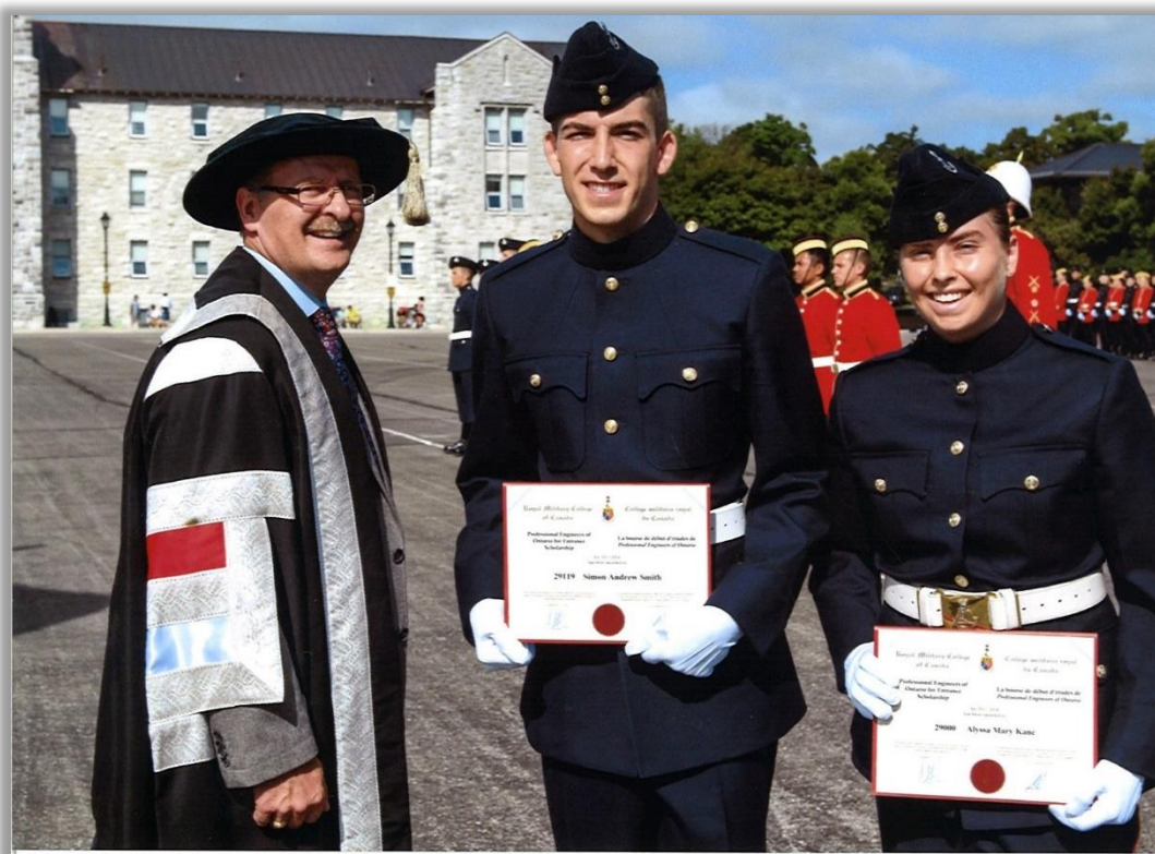
Presentation of Engineers Foundation Entrance Awards at Royal Military College of Canada

A total of $42,000 was given to 28 first year engineering students who attained high academic standing in their final year of high school and were assessed to be well-rounded students with leadership characteristics. In each school, one male student and one female student received this scholarship. Over the past 21 years, the Engineers Foundation has awarded over $326,000 in scholarships to women entering engineering programs in Ontario.